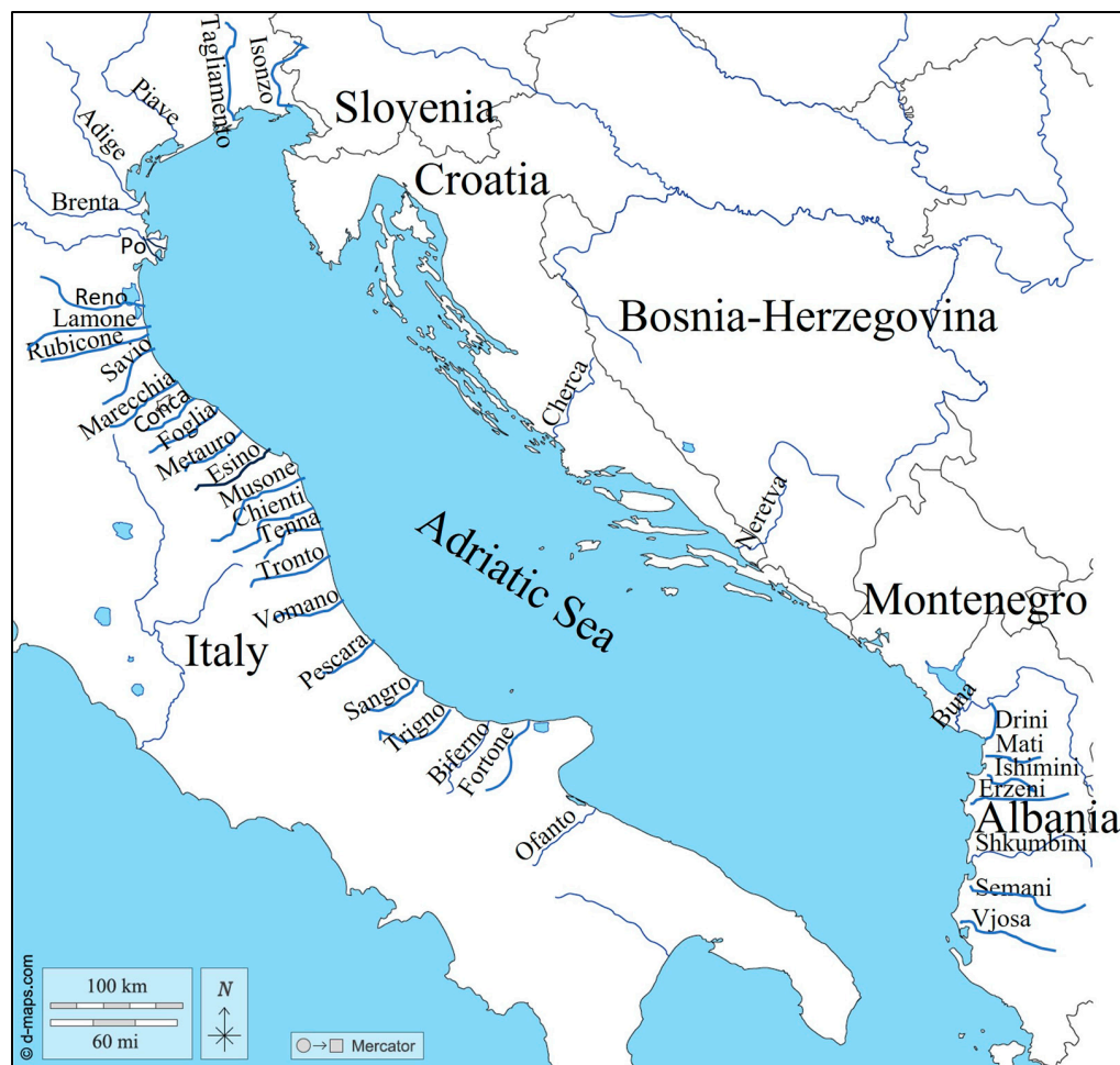
Figure 2. Map of the Adriatic coast showing the locations of the main rivers and streams that flow into the Adriatic Sea. The map was downloaded from the d-maps.com website http://www.d-maps.com (accessed on 3 January 2024) with subsequent modifications applied.

Drini, Mati, Ishimi, Erzeni, Shkumbini, Semani, and Vjosa Rivers, discharging a total of about 1250 \text{ m}^3\text{s}^{-1} into the basin [43,55] (Figure 2).